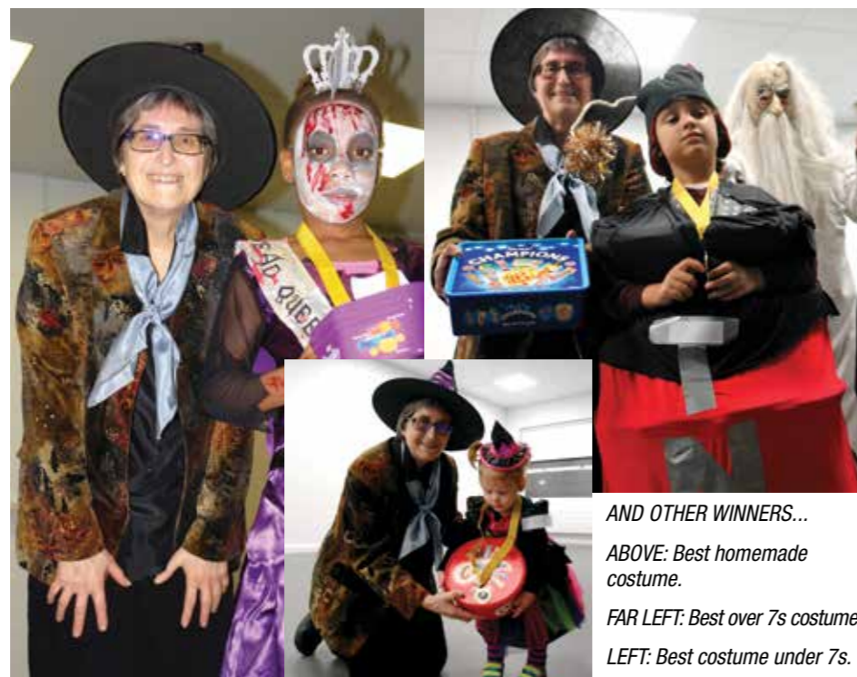
AND OTHER WINNERS...