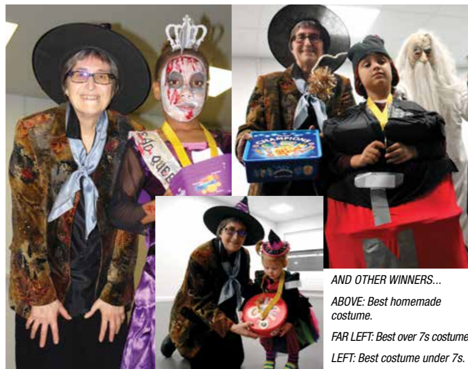
AND OTHER WINNERS... ABOVE: Best homemade costume. FAR LEFT: Best over 7s costume. LEFT: Best costume under 7s.