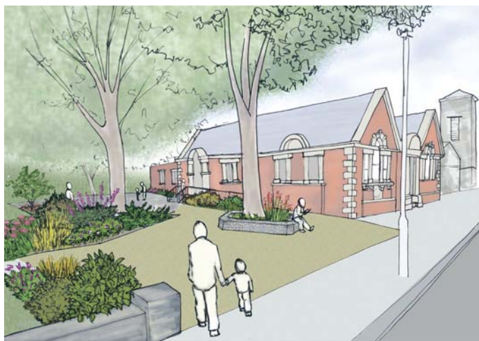
By removing the wall in front of the piazza, access and views into Home Park will be greatly improved

This September a new piazza will be built next to Sydenham Community Library in Home Park. Some fencing has already been removed outside the library to open up views into the park. The piazza will provide a venue for events for both Sydenham Community Library and Home Park and will create a welcoming new entrance to the park.