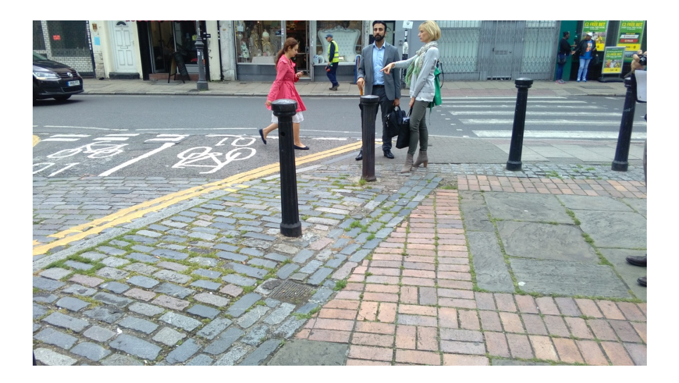
Plate 4. View west to Deptford High St showing interface with cobbles on Crossfield St

Plate 3. View of church forecourt south towards Crossfield St. Level difference clear at bollard line. Tree to be removed and replaced in same location.