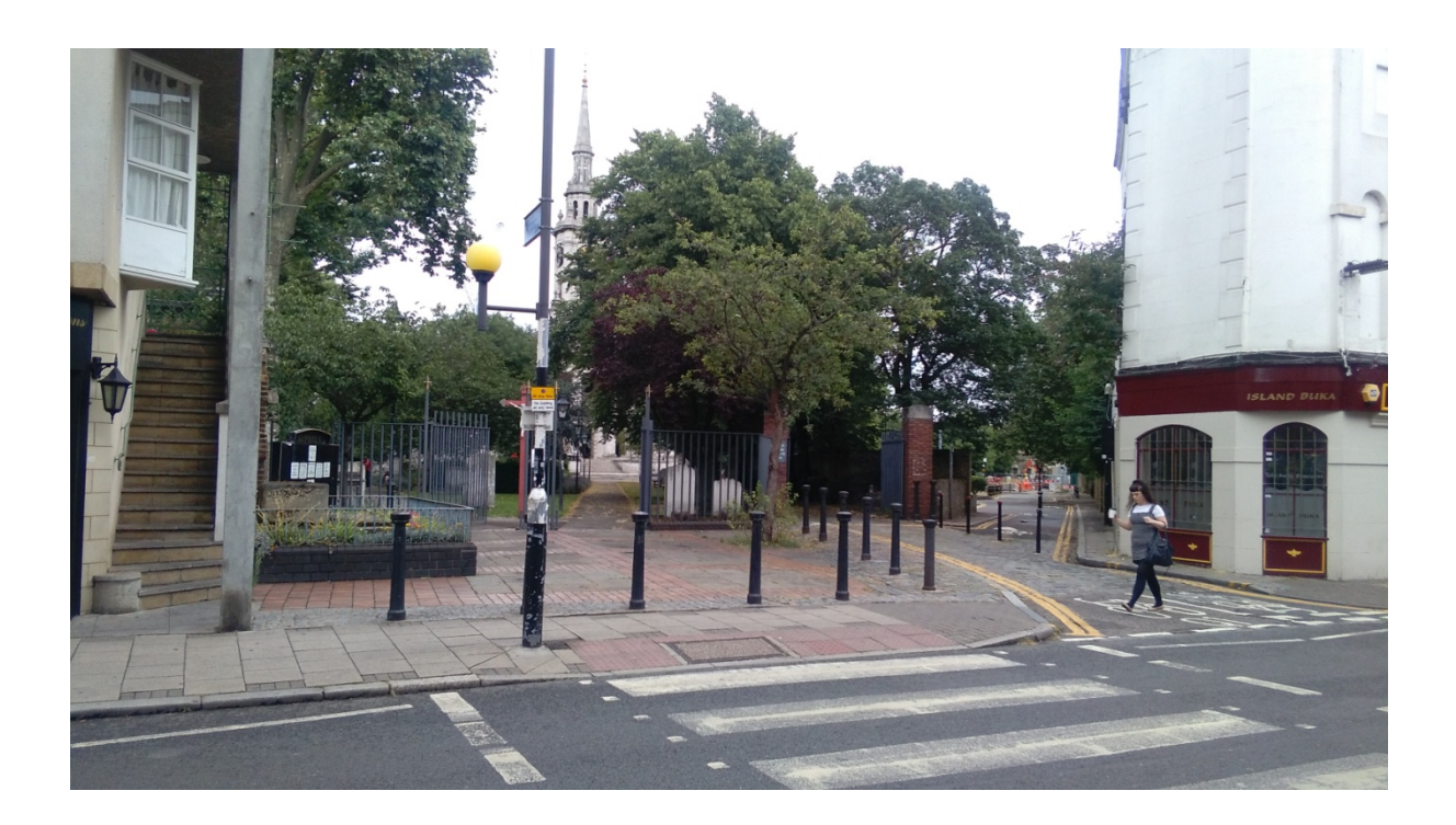
Plate 1. View of church forecourt and Crossfield St from Deptford High St

Plate 2. View north showing grid pattern paving, notice board to be removed and raised burial surrounded by a low wall and rail.