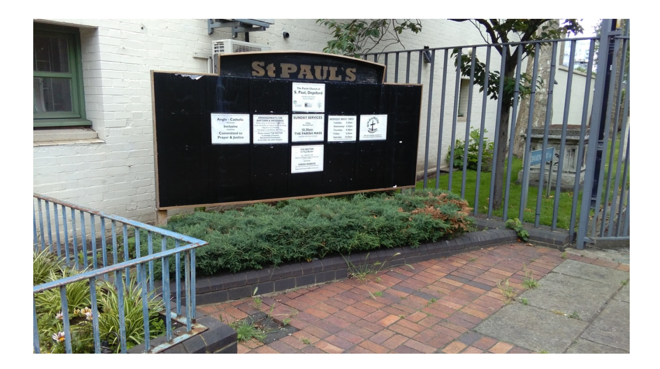
Plate 6. View of notice board ot be replaced and detail of iron railings and engineering brick walls

Plate 5. View of Crossfield St. Level difference clear at bollard line. Quietway closure motorised traffic visible centre rear.