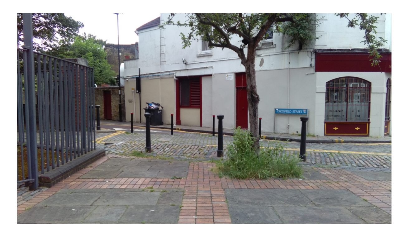
Plate 3. View of church forecourt south towards Crossfield St. Level difference clear at bollard line. Tree to be removed and replaced in same location.

Plate 4. View west to Deptford High St showing interface with cobbles on Crossfield St