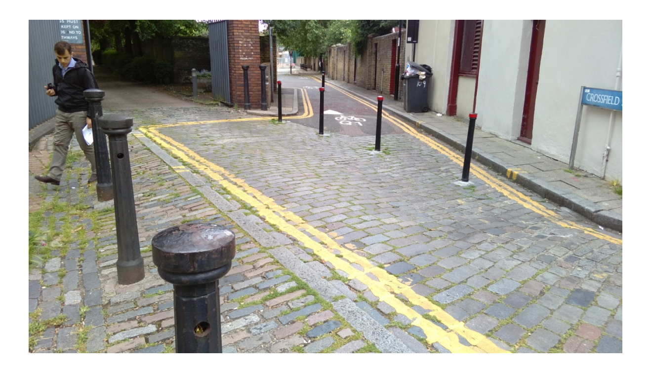
Plate 5. View of Crossfield St. Level difference clear at bollard line. Quietway closure motorised traffic visible centre rear.

Plate 6. View of notice board ot be replaced and detail of iron railings and engineering brick walls