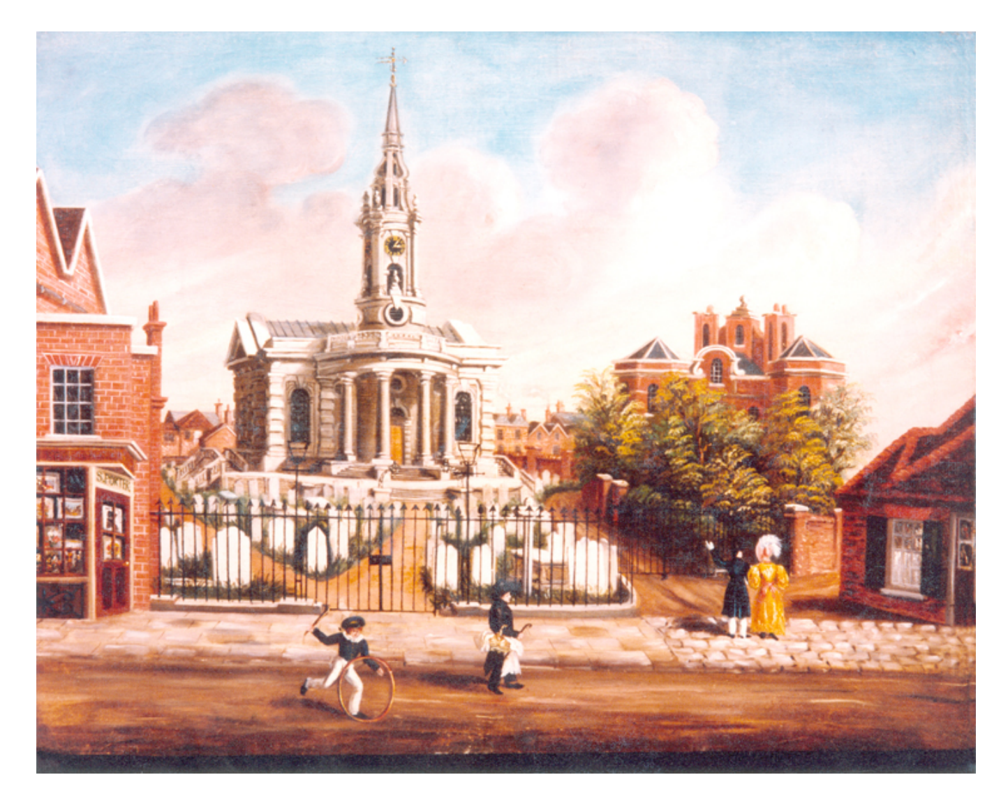
Fig 1. Illustration from c.1830 showing extent of S. Paul's churchyard right up to the Public Highway Boundary. The axial route to the portico and a stone base to the railings are in evidence.