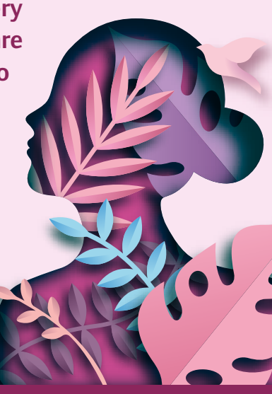
For more information visit the London Breast Screening website: london-breastscreening.org.uk

screening itself only takes a few moments".